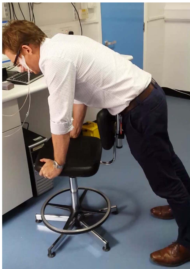
Figure 1 One of the authors (MH) performing a chair thrust on himself (see also online supplementary video).

The participant performed repeated maximal volitional cough and sniff manoeuvres. All manoeuvres were performed after exhalation to the end of a normal breath (at functional residual capacity) with mouth and glottis closed and a nose clip in situ.