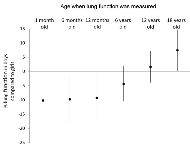
Figure 1 The mean difference in per cent of predicted lung function (circle) and 95% CIs (lines) at ages 1 month through to 18 years for boys compared with girls. The lung function measurement at 1, 6 and 12 months was maximal flow at functional residual capacity and at other ages was FEF 25-75 . These results were from a random coefficients model which was fitted using an unstructured covariance. The p value for the interaction between lung function and time was 0.0027. The model also included maternal asthma, infant atopy, flow limitation and maternal smoking.

pathways will be different for our cohort and others, there are differences in populations and study designs used which might, at least partly, explain the apparently different outcomes. For example, the COPSAC study 15 used a different methodology of infant lung function to that used in our study, and at 6 years of age children in our cohort had lower mean FEV 1 /FVC compared with 7-year-olds in COPSAC (0.87 vs 0.95), were more likely to be skin prick positive (38% vs 19%), and to have asthma (24% vs 16%); these differences in study design and population characteristics make direct comparison between COPSAC and our study unreliable. Participants in the Tucson study 3 were similar to ours in terms of atopy prevalence at 6 years (38% vs 41%), and the same index of infant lung function was measured in both studies, albeit in a smaller number of Tucson infants (125 vs 253) 26 ; it is possible that with a larger