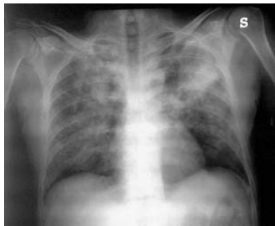
Figure 1 Chest radiograph showing bilateral air space opacities at a time when a very low level of NO was measured in the exhaled air.

radiograph (fig 1). The exhaled NO level had fallen to 2 ppb and BAL confirmed the diagnosis of DAH and excluded infection. Antineutrophil cytoplasm antibodies were reported to be present with a high titre of antibodies against myeloperoxidase. Sensory motor mononeuritis multiplex was diagnosed by electromyographic and nerve conduction studies. The patient fulfilled the criteria for the diagnosis of Churg-Strauss syndrome (CSS) and was treated with intravenous pulse methylprednisolone 1 g for 3 days followed by oral prednisone 1 mg/kg and cyclophosphamide 2 mg/kg/day. His clinical condition and oxygenation rapidly improved, together with progressive clearing of the chest radiograph. Exhaled NO levels measured 2, 5 and 8 days after the diagnostic BAL rose to 5, 9 and 15 ppb, respectively.