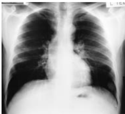
Figure 3 Chest radiograph following 3 months of treatment with GM-CSF showing complete resolution of the pulmonary infiltrates.

in May 1999. This was well tolerated with only minor pain experienced at the injection site. His leucocyte count rose to a peak of 29.4 \times 10^9/l (eosinophils 39%, neutrophils 52%) which improved following suspension of the treatment for 7 days. After 3 months of daily treatment with GM-CSF he was asymptomatic with normal spirometric values and arterial oxygenation, and resolution of the changes on the chest radiograph (fig 3), and has remained well with normal ventilatory function and a clear chest radiograph to date.