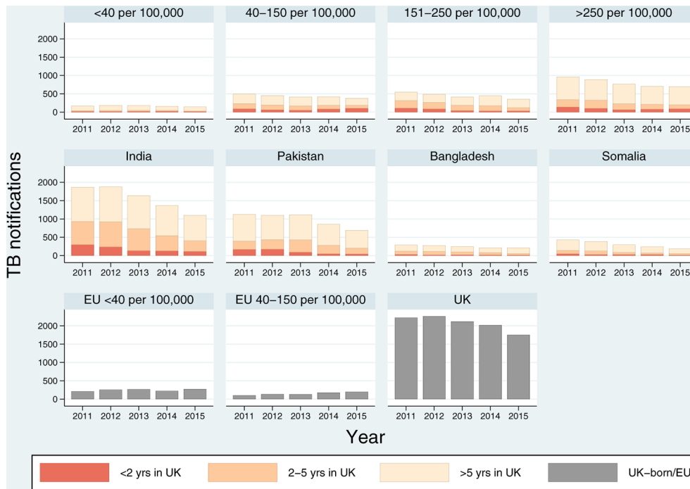
Figure 1 TB cases notified from 2011 to 2015 by country of birth/WHO incidence group and time since arrival in UK.

respectively. Conversely, there was a 24% increase in person-year contributions for those born in the EU and a 2% increase for those born in the UK.