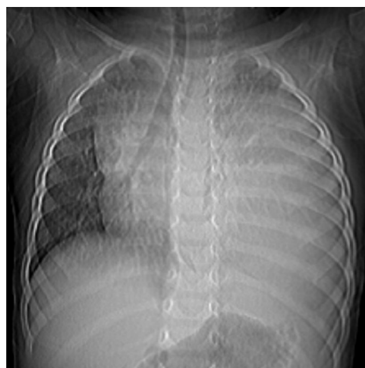
Figure 1 Chest x-ray showing opacification of the lower two-thirds of the left hemithorax. Part of the left upper lobe is still aerated.

A 2-year-old boy presented with fever, dry cough and dyspnoea for 3 days. Breath sounds were absent and thoracic percussion revealed dullness in the lower two-thirds of the left hemithorax. A chest x-ray showed almost complete opacification of these areas (figure 1). The boy was successfully treated with antibiotics for lower airways infection but tachypnoea persisted and the x-ray showed no change after 6 weeks. A CT scan was performed and showed a heterogeneous mass in the anterior mediastinum, predominantly on the left side, occupying most of the left hemithorax. This lesion showed areas of lower attenuation interspersed with areas of soft tissue attenuation (figure 2). The possibility of a germinative cell tumour was considered so \alpha -fetoprotein and \beta -human chorionic gonadotropin were measured but were found to be within normal limits. A percu-