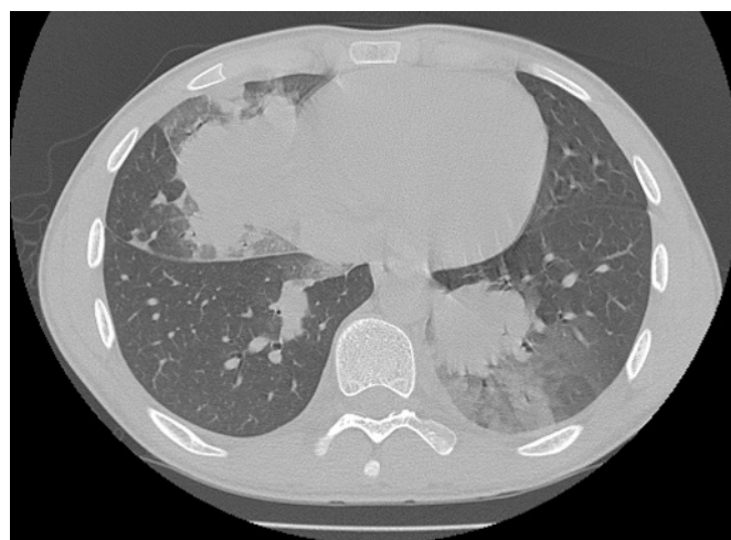
Figure 2 Axial CT image demonstrating air space consolidation of the right middle and lower lobes bilaterally.

demonstrated a rounded density in the right middle lobe (fig 1). Treatment with oral prednisolone, co-amoxiclav and nebulised salbutamol was commenced. A high-resolution CT scan of the thorax showed an area of consolidation in the right middle lobe and ground-glass attenuation in the right middle and bilateral lower lobes (fig 2).