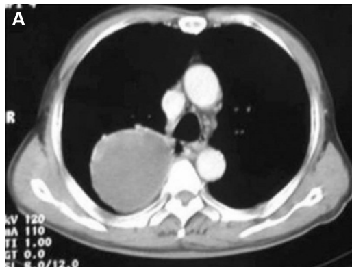
Figure 1 (A) CT scan of the chest showing a well defined cystic mass with mural nodules 10×7.5×7.0 cm in the medial aspect of the right upper lung. There were no enlarged mediastinal or hilar nodes. (B) MRI of the thorax showing a well defined cystic mass with mural nodules 8.5×7.5×7.5 cm in the right upper lung.

An 80-year-old man was admitted because he had experienced haemoptysis for 4 days. He had smoked 40 cigarettes daily for 50 years. He had no medical history except for chronic obstructive pulmonary disease. Physical examination and laboratory data were unremarkable. A chest radiograph revealed a mass lesion in the right upper lobe of the lung. A CT scan of the patient's chest (fig 1A) showed a well defined cystic mass with mural nodules in the medial aspect of the right upper lung. Magnetic resonance imaging (MRI) of the chest showed a well defined cystic mass with multiple mural nodules in the right upper lung zone, 5×7.5×7.5 cm in size (fig 1B). A CT-guided biopsy was performed and the pathology of the specimen indicated chronic inflammation.