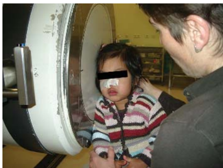
Figure 1 Toddler sitting on the nurse's lap, the camera facing the profile of the child. Two radioactive reference sources are applied, one beside the nasal tip and the other anterior to the right tragus.

The major part of the biopsy specimen was treated for cell culture in the sequential monolayer suspension culture procedure to evaluate the cilia after ciliogenesis as described