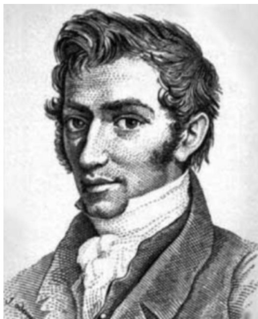
Figure 1 Lambert Adolphe Quetelet (1796–1874). This image is taken from a Belgian stamp issued in his honour in 1974.

Several studies agree that the effect of weight gain on lung function is greater in men than in women, probably due to gender-related differences in fat distribution (ie, the mechanical